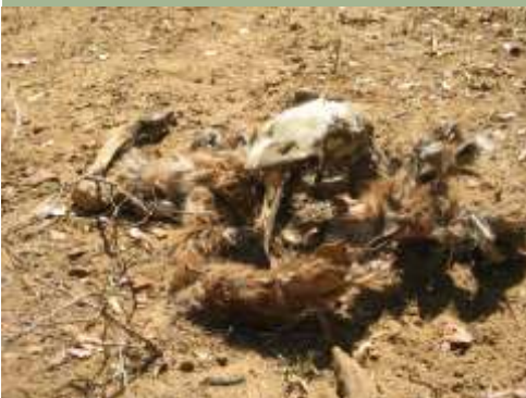
The Leopard kill, a sign that he has been visiting again

The ever elusive Leopard which passes through Phelwana and the surrounding area has been active again on the property. His spoors are abundant and our Field Guide came across a kill which he made. The territory sizes of male leopards vary between 30 km 2 and 78 km 2 . It is thus always exciting when he is visiting on the property.