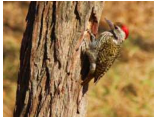
A beautiful woodpecker making his nest in a dead tree stump at the Lodge.

At Phelwana Game Lodge we continue to strive to provide our guests with fantastic facilities to enjoy. Our latest project is the upgrade of our “ Hippo Dam” function venue. We are building a kitchen, re-thatching the roof as well as upgrading the bathroom facilities so that this majestic site on the farm can be used for weddings, functions and Bushveld dinners.