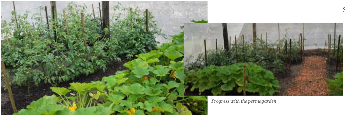
Progress with the permagarden