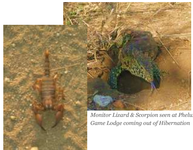
Monitor Lizard & Scorpion seen at Phelwana Game Lodge coming out of Hibernation