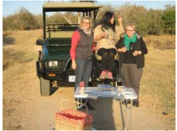
Guests enjoying a sunset game drive and drinks on the dam watching the Hippos

We are seeing an influx of our first guests visiting Phelwana. The early morning and late afternoon game drives as well as our bush walks have definitely made unforgettable memories for our guests. Our guests have also enjoyed a variety of activities in the area, Moholoholo Rehabilitation Center, The Endangered Species Center, Big 5 Game Drives, The Panorama Tour and of course, trips to the Kruger National Park. These day excursions can be booked through the Lodge. Phelwana is very well situated in proximity to these attractions and allows for convenient access to all these destinations.