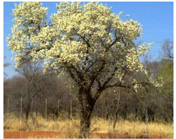
Dombeya Rorundifolia flowers early spring

Our Nyala's are also dropping their babies, with a multitude of young ones running around the farm with a spring in their step. They are providing much entertainment for our guests as they graze around the chalets and in front of the Main Lodge.