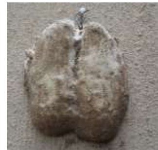
Animal spoors made at Phelwana Game Lodge

Please check out our FACEBOOK page at https://www.facebook.com/Phelwana , “like” it and receive regular updates from us from your news feed.