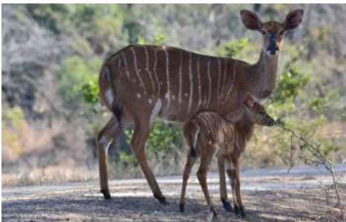
A baby Nyala with its mom seen in front of the Lodge

At Phelwana, it is always the small things that count. With spring, all the little animals come out of hibernation with the warmer weather and we have seen a multitude of Monitor Lizards and Scorpions amongst many other little creatures enjoying the warmer weather.