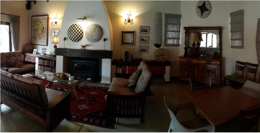
The Lounge in the Phelwana room has been tastefully decorated for your enjoyment.