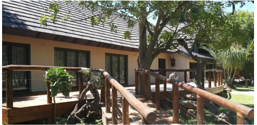
A facelift to the old Lodge building, plastering of the walls has given the Lodge new look.

We decided to give the old lodge building, now the Phelwana Room, a new look along with its new roof. This building gives a home to the restaurant and reception.