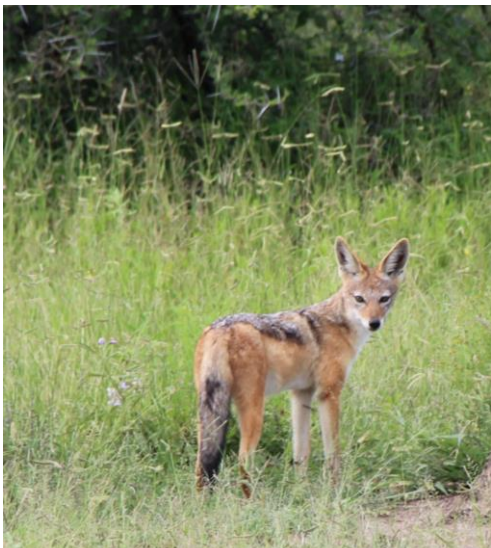
Black-backed Jackals have returned to Phelwana Game Lodge.

A leopard has also made a couple of appearances lately and was observed by guests in January prowling the bush at night.