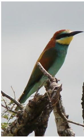
A European Bee-eater photographed this month.

The Phelwana Room, which houses our restaurant and lounge, has been tastefully furnished with old and new family heirlooms. Our lounge is comfortable and inviting for guests to enjoy our private collection of books at leisure. Sit back and listen to the sound of beautiful African music whilst sipping a cup of freshly brewed coffee.