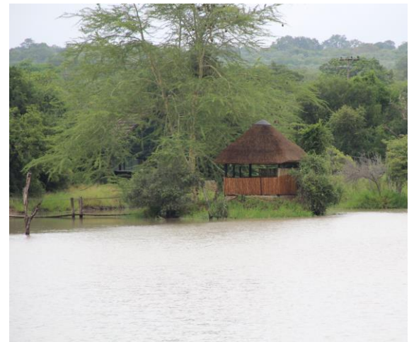
The bird hide on the Phelwana Dam has been re-thatched and re-roofed.

We have recently renovated the bird hide in the middle of the Phelwana Dam which is a sanctuary for bird lovers to sit on the tranquil island and enjoy the abundant birdlife at Phelwana Game Lodge. Fish Eagles and of Kingfishers can often be heard in trees around the dam trying their luck to catch their daily meal. A picnic lunch can be made in advance to accompany you whilst bird watching.