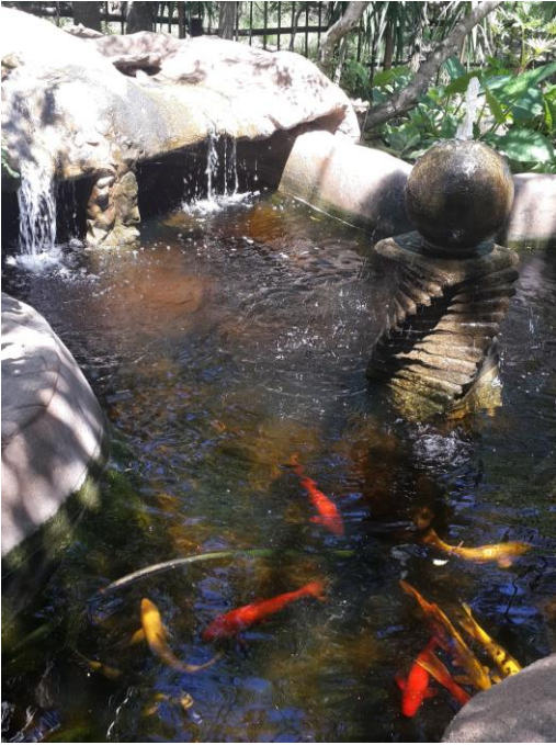
The Koi pond in the garden in front of the Main Lodge.