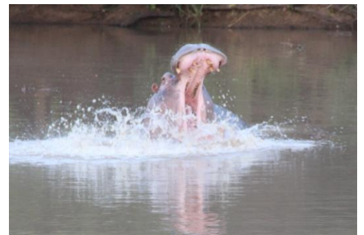
Our resident bull photographed in Hippo Dam.

Phelwana has seen over 700 mm of rain this season and our dams have filled up to sustain the animals during the winter months to come. The Hippos have returned to Hippo Dam since the water level has risen and can be seen frolicking in the evenings as photographed aside.