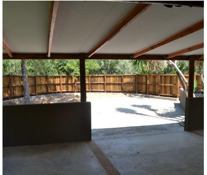
The new Lapa photographed from inside the Phelwana Bar.

Thank you for your comments about our new entrance gate. It certainly has resulted in a bigger success than we envisaged! A new gate house has been constructed neatly behind the vegetation and is unnoticeable to the eye, allowing the entrance to be operational 24 hours a day and in constant contact via CCTV and 2 way radio with our reception.