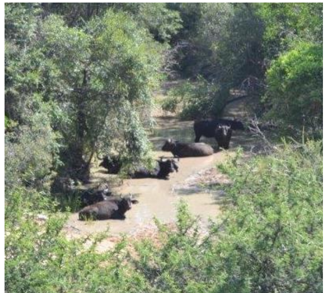
Our resident heard of buffalo seeking some relief from the summer heat in the riverbed.