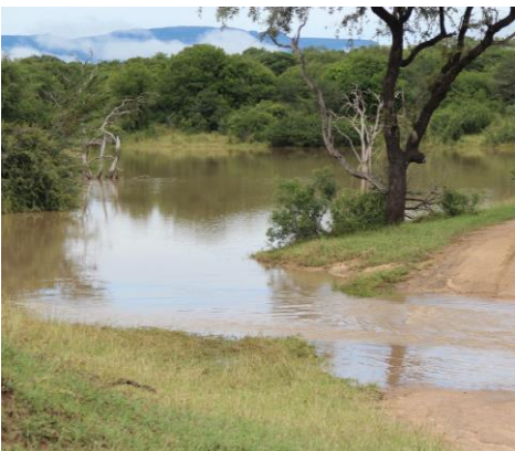
5 March 2014 – Hippo Dam broke its banks

“...200mm falling within 48 hours resulting in significant flooding happening in the greater Hoedspruit/Blyde area...”