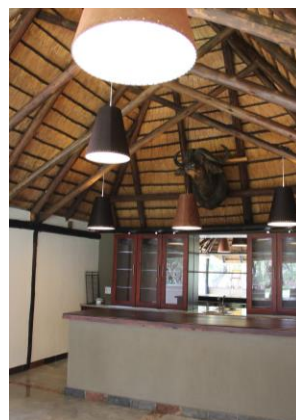
The Phelwana Bush Pub

We are very excited to announce that our new Facebook page is live. Please check it out at https://www.facebook.com/Phelwana , “like” it and receive regular updates from us from your news feed.