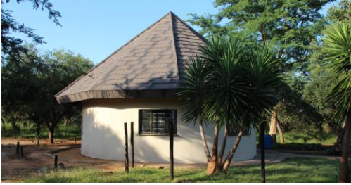
Progress at one of the two sleeper Bush Chalets

As mentioned in our previous newsletter, all of our Chalets are undergoing major renovations.