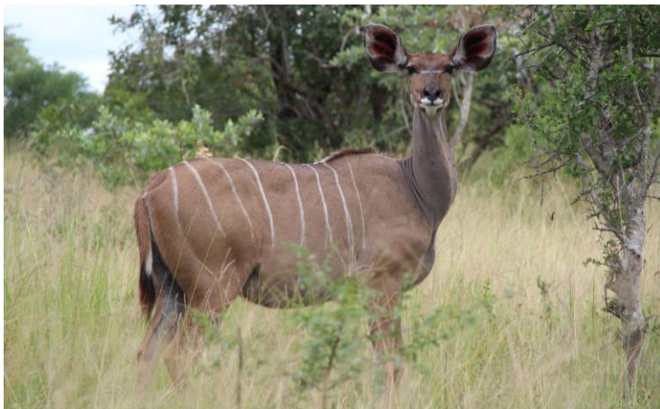
A Beautiful Kudu photographed at Phelwana Game Lodge in March

The Phelwana Bar and Lapa remain a pivotal attraction to enjoy the beautiful bushveld evenings under the African stars around a crackling fire. Guests are encouraged to make their way down to the Lapa and Bush Pub in the evenings after dinner to enjoy an after dinner coffee or liqueur. There is no better experience than sitting around a fire, listening to all the bush noises and if you are lucky you might even hear our resident jackals making their soulful calls.