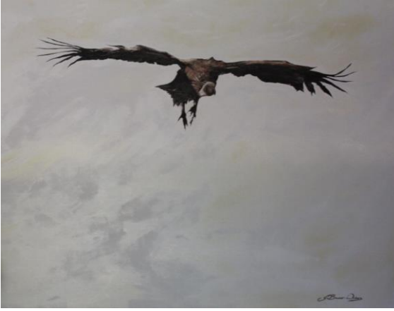
Gail Bowers-Winters' vulture in flight