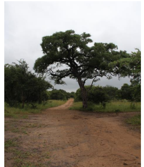
A view of the Bush on one of our game walks

For our fishing enthusiasts, we have three dams, Phelwana, Hippo and Nyala Dam and guests are welcome to test their hand at fishing. Our dams are host to very large Cat fish and Carp, which provide good fun in the surroundings of the beautiful Bushveld