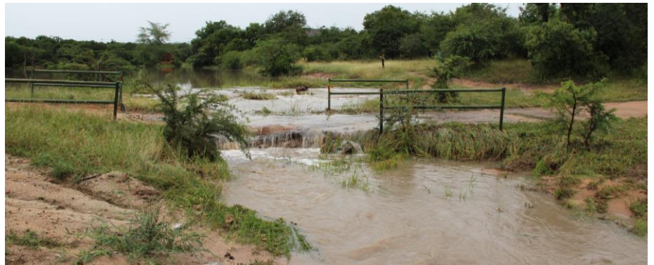
The overflow at Phelwana Dam in front of the Main Lodge