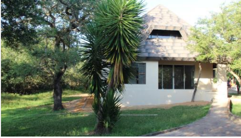
A Chalet accommodating 6 guests starting to take shape