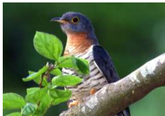
A Red Chested Cuckoo ('Piet-my-vrou') is a migrant to the Lowveld during Spring and its call is a sure sign summer is on its way.