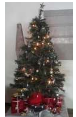
Our Christmas Tree is decorated and ready for the festive season!

Guernsey Road Hoedspruit Limpopo +27 15 793 2475 book@phelwana.co.za www.phelwana.co.za