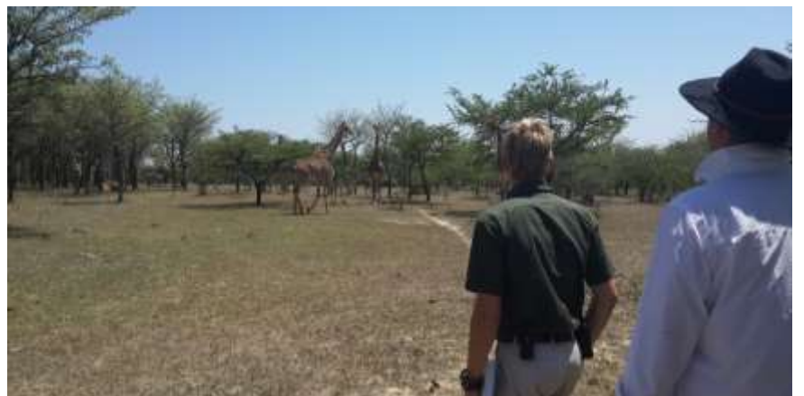
We came across a menagerie of animals on foot, getting up close to giraffe, zebra and impala! What a great experience for our guests!