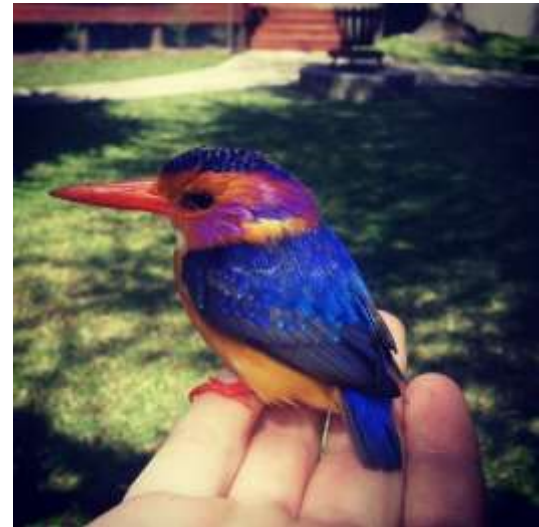
A Pygmy Kingfisher rescued at the Lodge

To name one, the Red Chested Cuckoo ('Piet-My-Vrou') has arrived with spring – its call pierces the warm, balmy days and nights. Another regular migratory visitor to the Lowveld is the Pygmy Kingfisher which has resulted in a couple of rescues needed by our willing staff. The Pigmy Kingfisher is notorious for flying into windows, but luckily the few casualties we have had, have all resulted in a few mildly stunned birds which have flown away back into the bush.