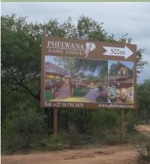
Our new sign board on the Guernsey Road.

We have erected a new Phelwana Game Lodge sign board on the Guernsey road near our main gate. It is bold with a few beautiful photographs of the Lodge. It is aimed at welcoming guests on arrival as well as directing guests to our main gate.